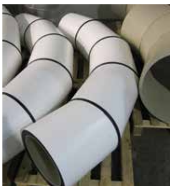
MINELINE Stub flange