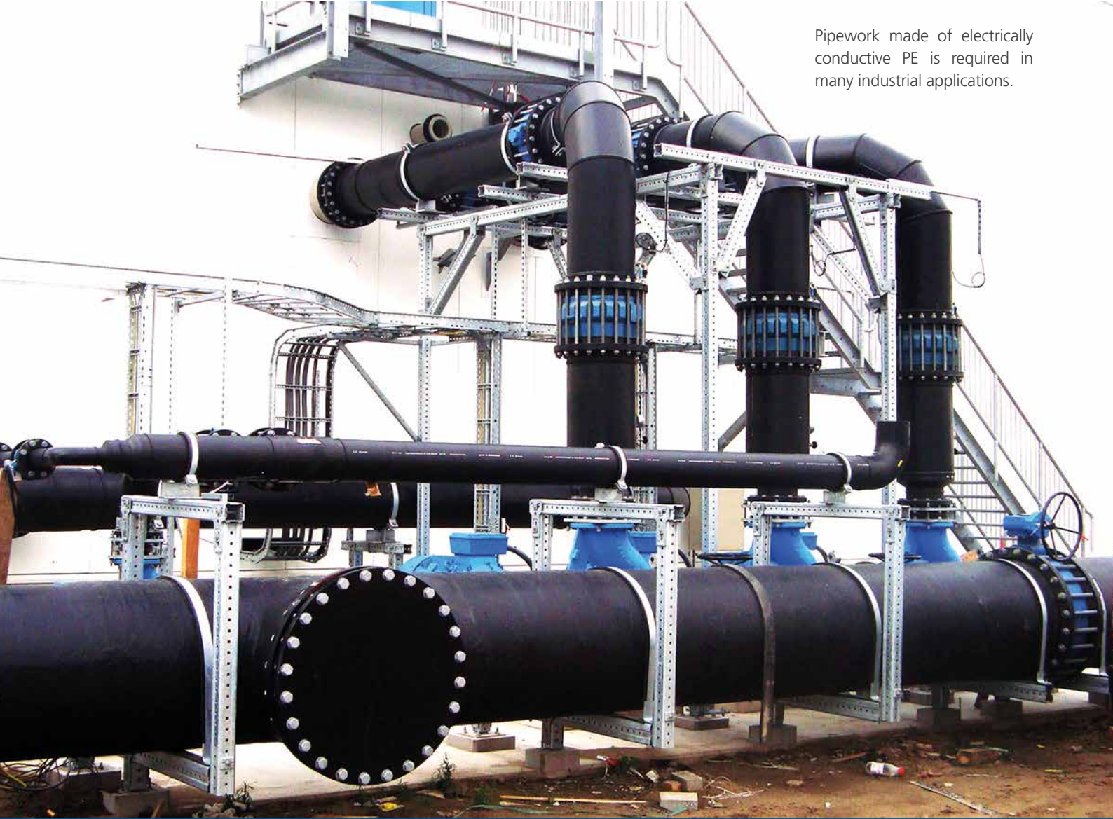
Pipework made of electrically conductive PE is required in many industrial applications.