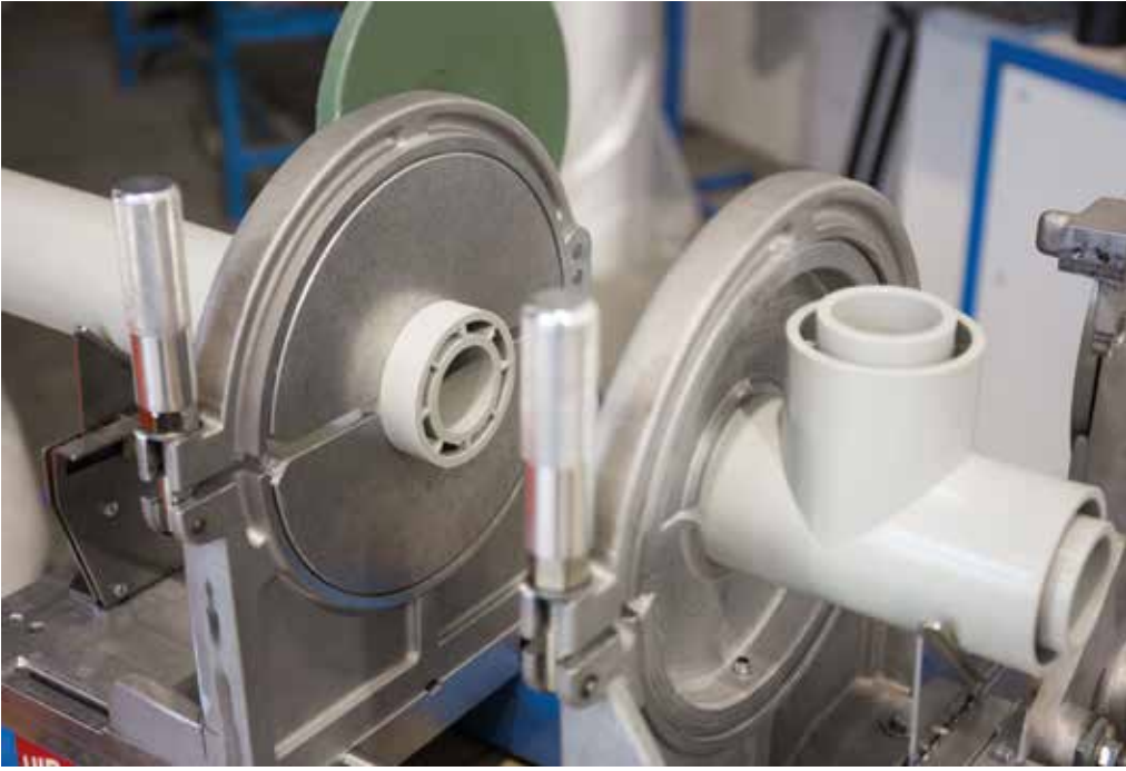
The AGRU Poly-Flo double containment piping system can be joined using time-saving simultaneous welding.