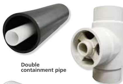
Double containment pipe