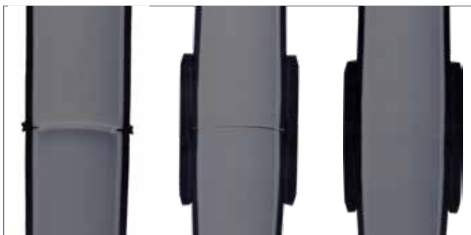
Heated element butt welding

In addition to the safe three-layer structure, MINELINE II can be connected using a combination of butt and electro-socket welding. This helps to avoid potential weak points and protects the inner pipe against abrasion.